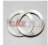
620 SJ Kammprofile Gasket with Loose Outer Ring

Depending on centering ring with cheaper material (Normal: CS) and thinner thickness (Normal: 1.5mm) for Style 620 SJ, maybe it is more economical than 620JR.