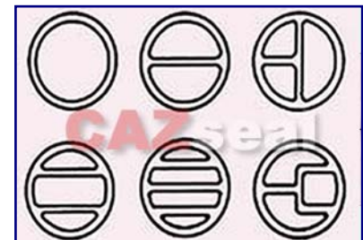
For Heat Exchanger

CAZ 630 CM 900×940×4.5mm (ID×OD×Thick) with 1 rib (width 20mm) Material: SS316+Graphite Thickness of metal: 3mm