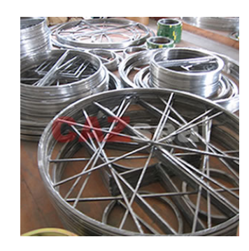
Welding bar is economical